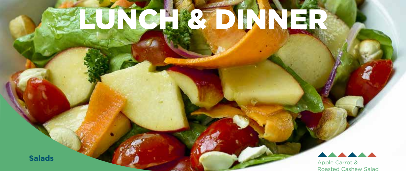
Apple Carrot & Roasted Cashew Salad